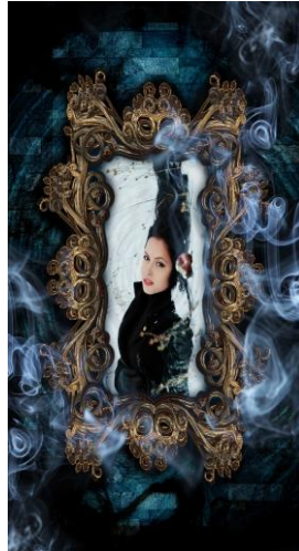
Mirror Mirror on the wall ....

Concave Mirrors, Non-Reversing Mirrors, Silvered Mirrors, Two-Way Mirrors, & Others